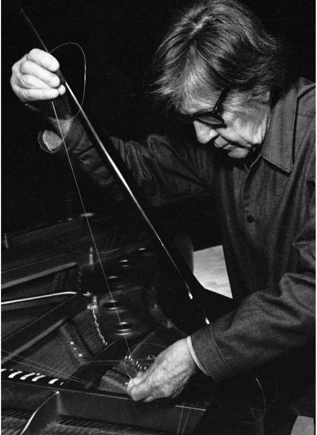
Photograph of John Cage.